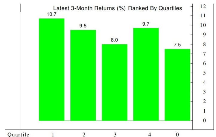
Figure 5 S&P 500 Stock Constituents* Ranked by

*Actual Historical Constituents. Returns through 9/30/2024