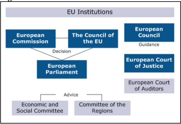
Top EU Institutions

Council of the European Union. With a name so similar to the European Council's. this body is a source of confusion among reporters, voters, and foreign observers. However, the similar names make sense, given the similar mandate of the bodies. Whereas the European Council is a forum for advice and guidance from EU member states, the Council of the European Union is a forum for the member states' governments. Importantly, it has the power to approve proposed EU laws, along with the European Parliament (meaning it also has some similarities to the US Senate). The Council of the EU meets in different configurations depending on the topic discussed. For example, all the EU finance ministers would meet to approve a proposed law on financial regulation. All the EU environment ministers would meet to